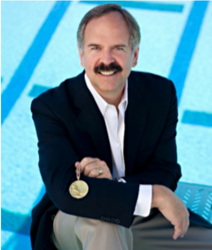
Keynote Speaker John Naber A five-time Olympic Medal Winner